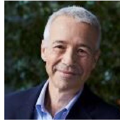
Joaquin Duato Vice Chairman of the Executive Committee Johnson & Johnson