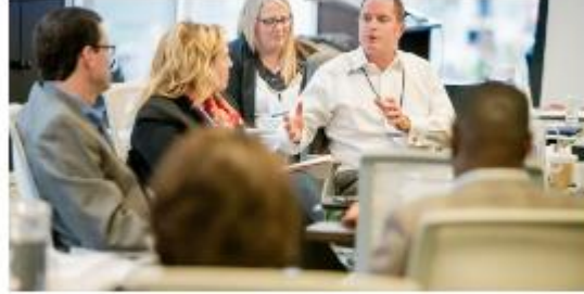
Human Resources Executives Council