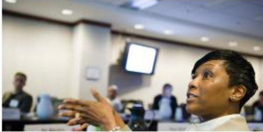
Global CHRO Council