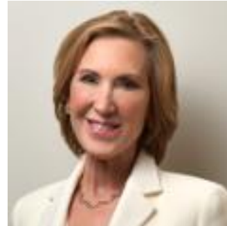
Carly Fiorina Founder and Chairwoman Carly Fiorina Enterprises & Unlocking Potential Foundation Former CEO Hewlett Packard