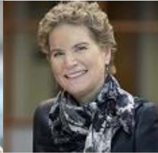
Susan C. Schwab Strategic Advisor Mayer Brown USTR, Ambassador