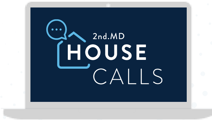
2nd.MD House Calls Webinars