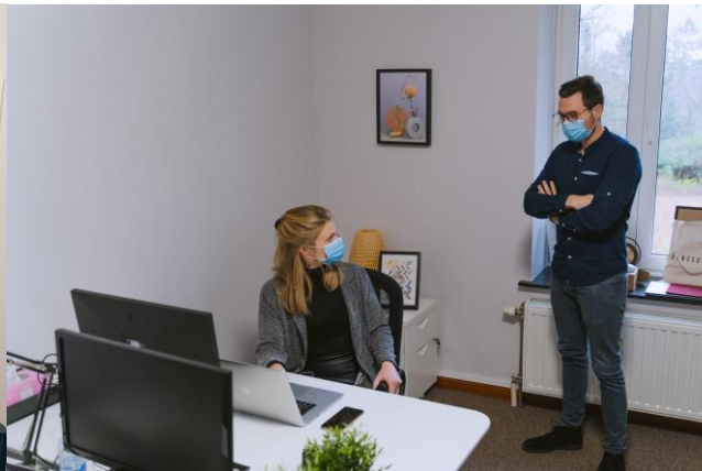
From “Personal” Wellness to “Social” Wellness and a Safe Workplace