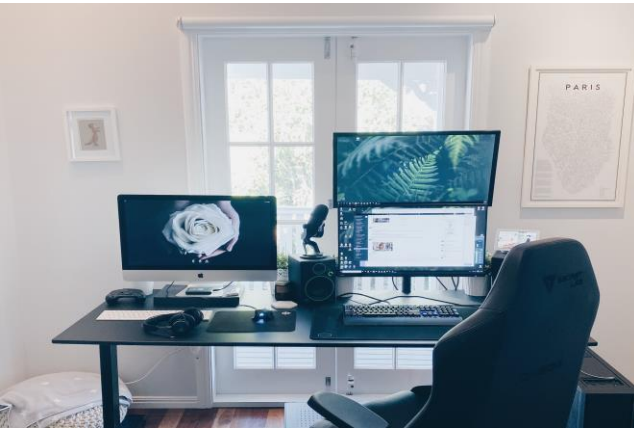
When Work Becomes Home and Home Becomes Work