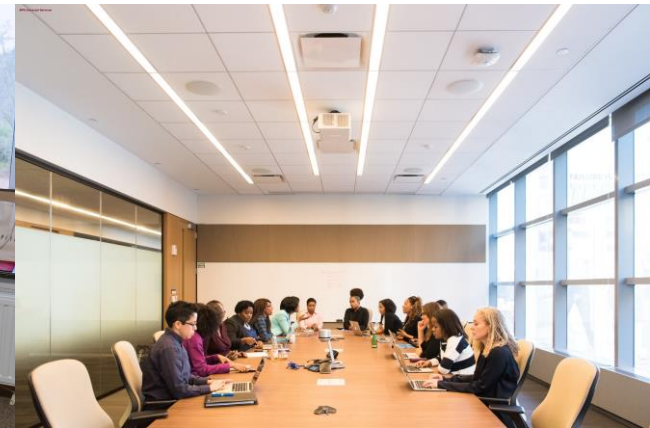
Building an Inclusive Culture Everywhere