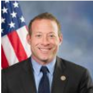
U.S. Representative Josh Gottheimer New Jersey's 5th Congressional District