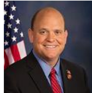
U.S. Representative Thomas Reed New York's 23rd Congressional District