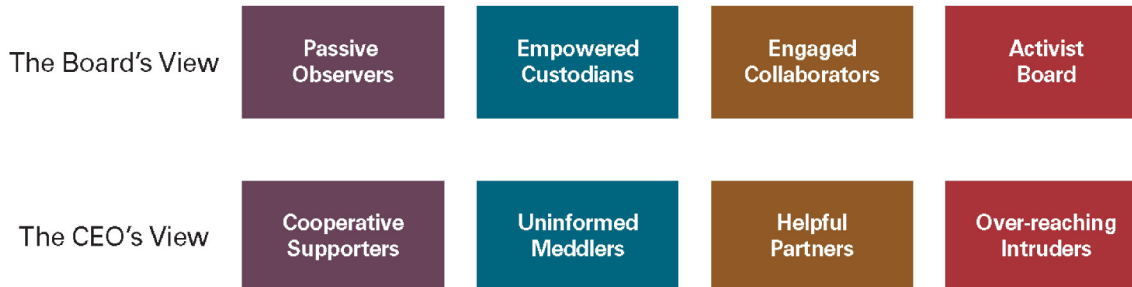
FIGURE 1: Range of Board Roles

Make no mistake: More and more CEOs understand the board's potential as a valuable resource rather than a necessary evil. Effective boards help the CEO to avoid bad decisions and make better ones. Good boards bring a wealth of experience, knowledge and insight to the table—and confident CEOs welcome that. But reaching that point of mutual respect isn't always easy. A major shift in the relative balance of power within any relationship provokes a range of emotional responses, and the relationship between the CEO and the board is no different.